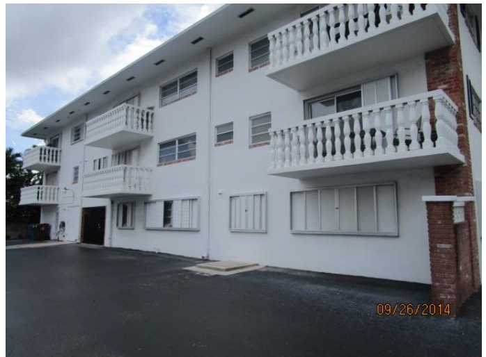
LEFT SIDE 09/26/2014