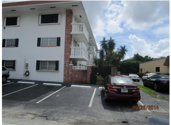
RIGHT SIDE 09/26/2014