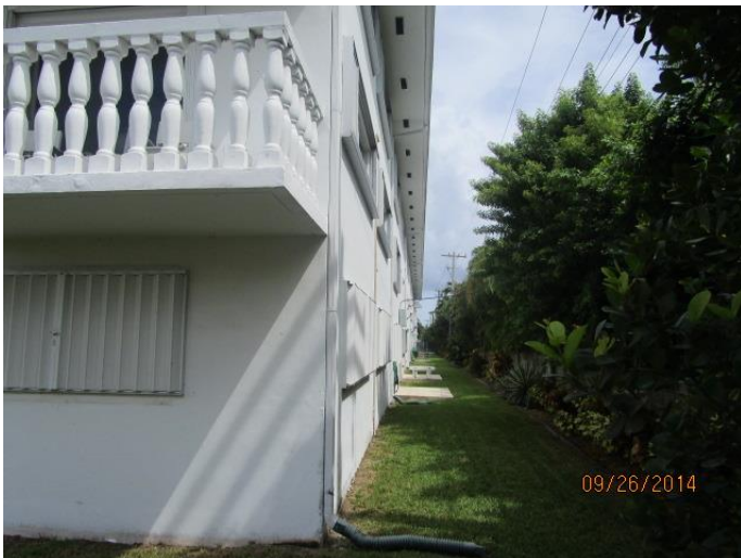
REAR VIEW 09/26/2014