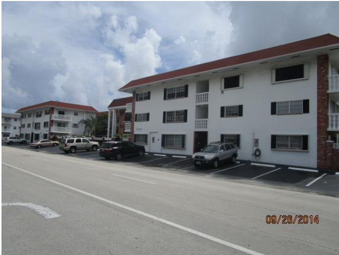
FRONT VIEW 09/26/2014

If using the Elevation Certificate to obtain NFIP flood insurance, affix at least 2 building photographs below according to the instructions for Item A6. Identify all photographs with date taken; "Front View" and "Rear View"; and, if required, "Right Side View" and "Left Side View." When applicable, photographs must show the foundation with representative examples of the flood openings or vents, as indicated in Section A8. If submitting more photographs than will fit on this page, use the Continuation Page.